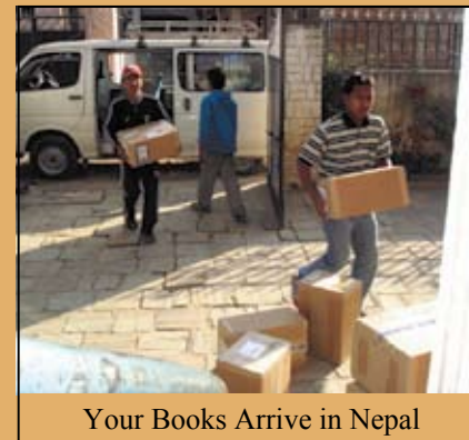
Your Books Arrive in Nepal