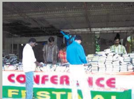
Christians browsing CRI's free books

It had all the novelty of browsing a bookstore, thumbing through books, and walking up to the register with your purchase!