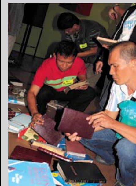
Pastors at the conferences eagerly sorted through books sent by you! Do you see your favorite in there?